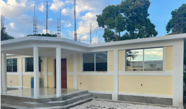
Sorbonne Christian Academy Kindergarten Land Purchased 2017 Completed 2/2023 Total Cost: $92,550