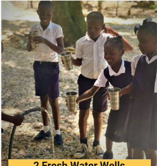
2 Fresh Water Wells Completed 2/2021 Cost: $11,000