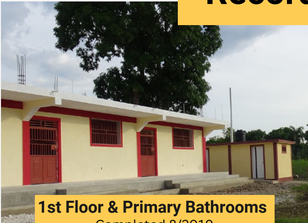
1st Floor & Primary Bathrooms Completed 8/2019 Bathroom Cost: $9,500