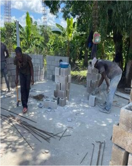
Work begins on the new kindergarten building despite unavailability of building materials.

As incredible as it sounds, Operation Outpour and the board decided to move ahead with the construction of a new Kindergarten building. That was at the end of January 2022—last year. It was shortly after that that all of the political and civil issues began to break out. There were gang riots due to high gas and diesel prices. Unrest grew to the point that Haiti requested foreign military assistance to assist with restoring some semblance of law and order.