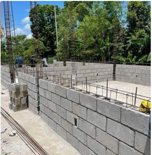
Work has begun and the walls are beginning to take shape.

Supply chain issues also contributed to construction delays. Main roads were barricaded and some even trenched across to prevent normal travel. Trucks needed to deliver construction supplies were unable to buy fuel for some time. That resulted in additional delays. In addition, rampant inflation in excess of 20% resulted in a significant increase in the cost of materials.