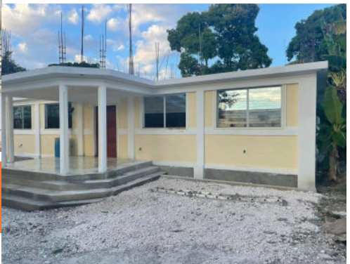
Kindergarten nearly completed

school year stands at approximately 175 students. You've been faithful. God is faithful. We've been placed here for such a time as this. We appreciate all of you!