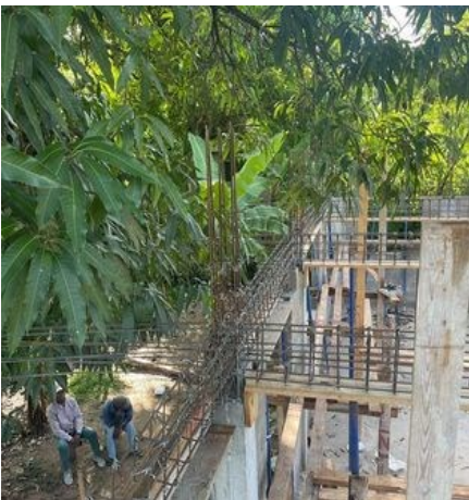
Rooftop view of construction

In the picture below left, the walls have been completed and the rebar has been installed in preparation for the concrete roof. The photo below right shows the new kindergarten building nearly completed. Painting will be completed shortly and the building will be ready for students. And that's a good thing, because student enrollment for the current